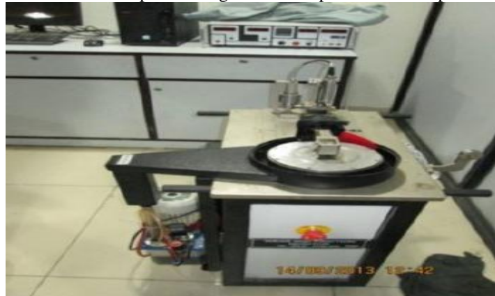
Fig. 2. Pin on disc Set Up

Pin on Disc friction and wear monitor TR 20L is used to investigate wear characteristics of PEEK composites as per ASTM G 99 standards. The disc used is EN-31 stainless steel with hardness 60 HRC, 140mm trac diameter and 8mm thick, with surface roughness of 0.3Ra. Complate arrangement of Experimental set up is shown in fig.2. below.